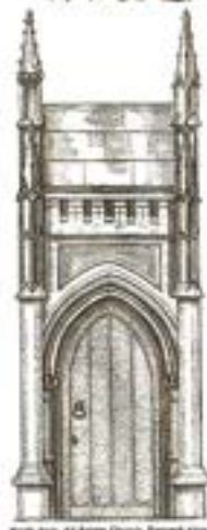
Archway, All Saints Church, Stamford