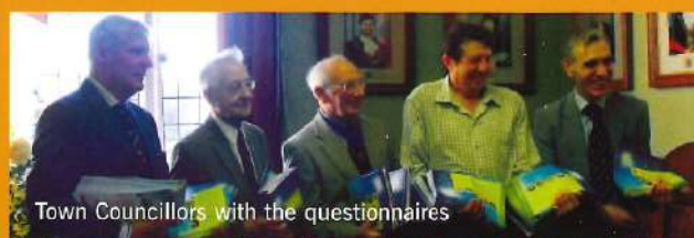
Town Councillors with the questionnaires

During the course of the year the Town Hall is made available, free of charge, for six charitable events or worthy causes. Selection is entirely at the Mayor's personal discretion and is strictly subject to availability. Applications giving fullest details of the charity or cause supported and the event proposed should be submitted, in writing, to the Town Clerk, Town Hall, St. Mary's Hill, Stamford PE9 2DR.