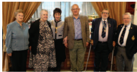
Polish Paratroopers Remembered - Page 5