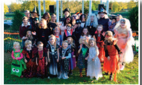
Stamford Spooktacular - Page 5