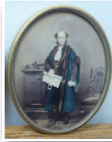
A Wonderful Gift - Page 2