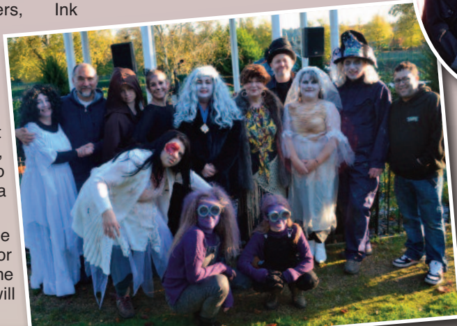
Left: Councillors & Friends Team.