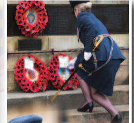
Battle of Britain - Page 3