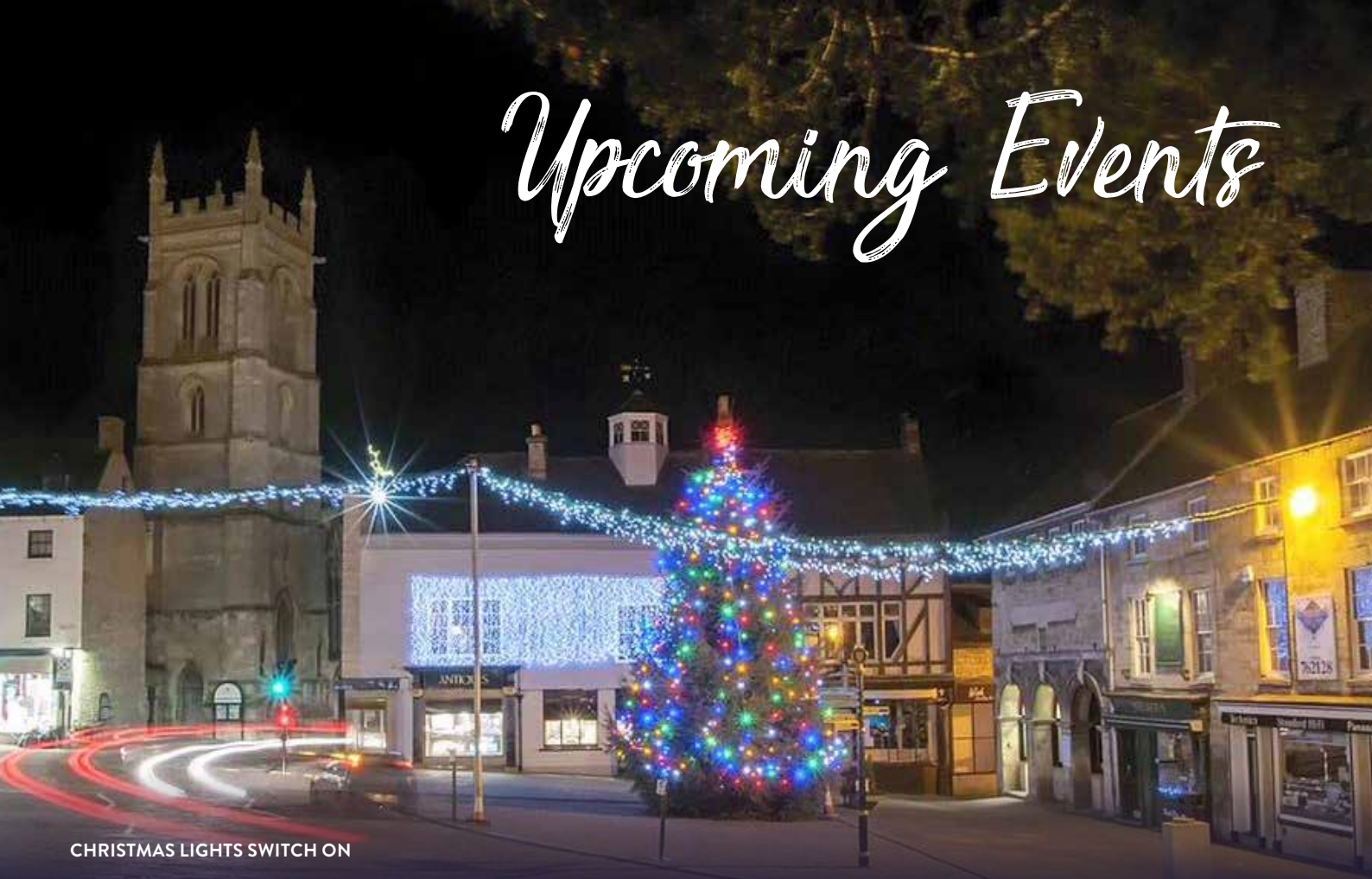
CHRISTMAS LIGHTS SWITCH ON