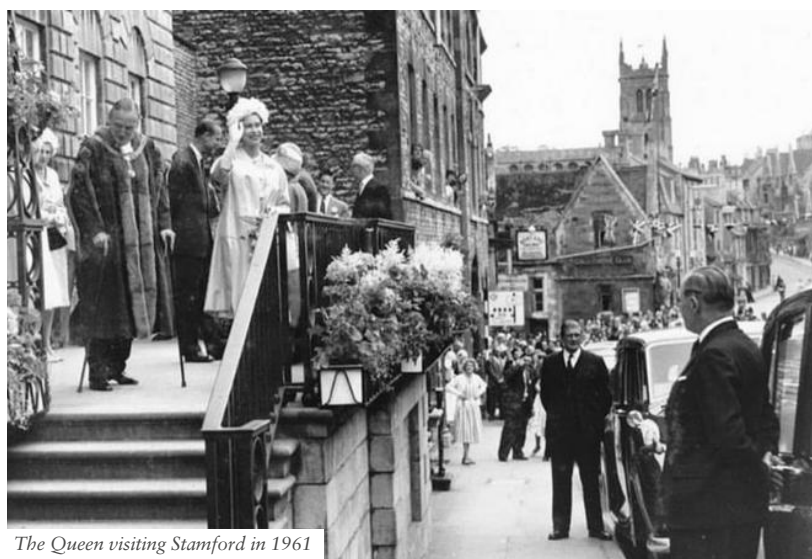
The Queen visiting Stamford in 1961

At 10.15am sharp, the troops from the various forces and their bands marched out of Wellington Barracks to their designated positions – some to Westminster Abbey, the rest to Horseguards Parade and Whitehall where they massed and stood to attention