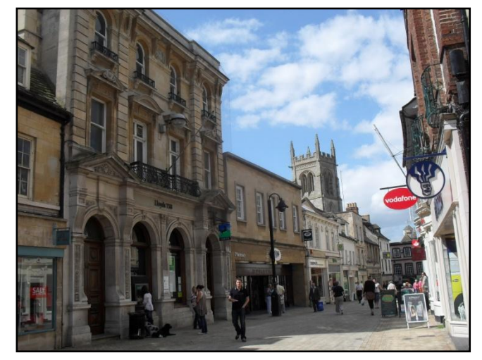
Fig. 11. Western view along High Street towards St John's Church and Red Lion Square.

occupied by Walkers Books, is an attractive timber framed