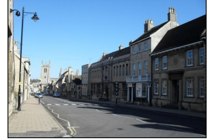
Fig. 25. Northern view along High Street St Martin's.

the William Cecil Hotel on the east side with open fields between the town and the neighbouring village of Wothorpe on the west.