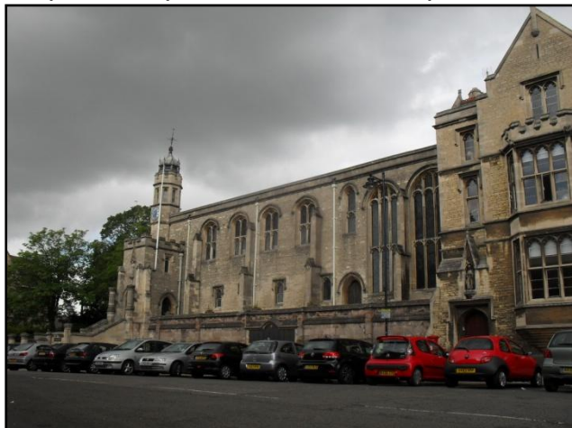
Fig. 4. Browne's Hospital, Broad Street.

in East Anglia, West Yorkshire and the West Midlands. The mid-Lent fair declined in popularity due to the impact of the Hundred Years War which imposed export restrictions and prevented the attendance of large numbers of