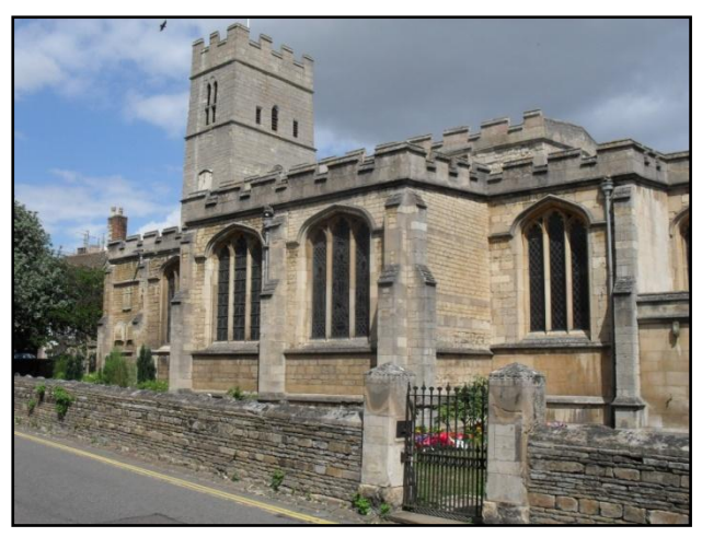
Fig.8. St Georges Church

The town has retained five of the medieval parish churches, all of which are Grade I listed buildings, and the towers and spires are a key feature of the historic skyline. Remnants of the 12<sup>th</sup> century St Paul's Church are incorporated into the Stamford School Chapel. The churches were in existence by the 12<sup>th</sup> century and All Saints' was founded in the pre-Conquest period, although they have