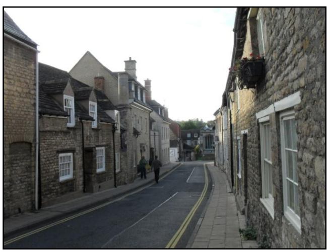
Fig. 21. Southern view along St George's Street.

the street with the trees of Burghley Park rising above the roofline. The spire of St Mary's Church can be glimpsed in the break in the building frontages on the west side.