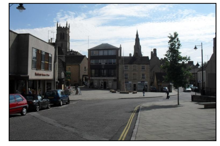
Fig. 18. East side of Sheep Market.

enclosed by a high stone boundary wall. The rear elevations of the buildings on All Saints' Street and off street car parks face the north side.