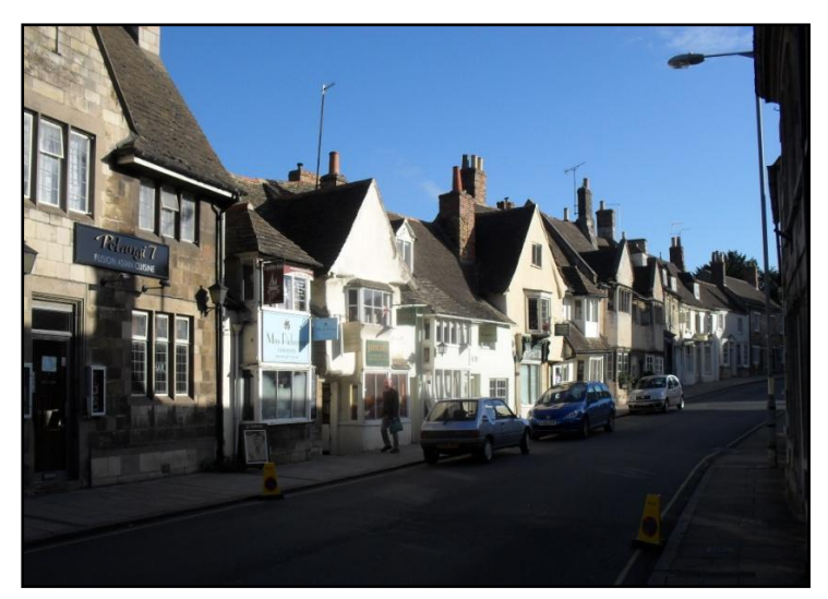
Fig. 3. Medieval buildings on the north side of St Paul's

The town's high status and prosperity attracted six religious orders which established houses on the periphery of the town centre; St Leonard's Priory, Greyfriars, Blackfriars and the Carmelites stood to the east, Austin Friars to the west and St Michael's Nunnery stood on the south bank on the periphery