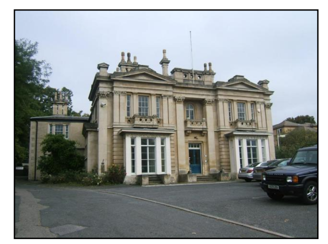
Fig. 16. Rock House and adjacent petrol station.

Victorian Italianate style villa built for Newcomb; No. 31 on the south side was originally the stables to Rock House. The Scotgate public house has an attractive decorative terracotta front by Blashfield. Truesdale