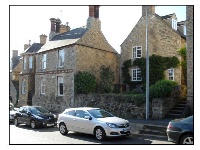
Fig. 32. Empingham Road.

The south side comprises of a group of attractive brick and stone buildings with decorative brick detailing aligned to the rear of the footway. Nos. 20-34 is a terrace of small attractive cottages set back from the footway with small front gardens, some of which have