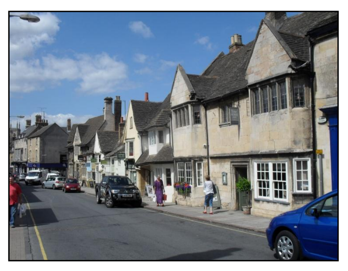
Fig. 23. Westward view along the north side of St Paul's Street.