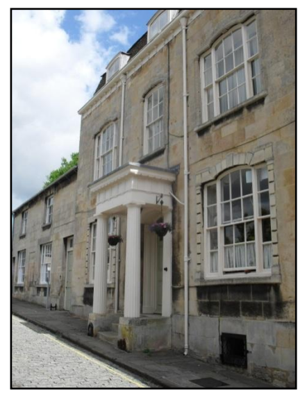
Fig. 15. Classical façade, No. 9 Barn Hill.

The west side has a lower density of development as Barn Hill House stands in large grounds which occupies approximately half of the street. The large detached house is medieval in origin and was rebuilt in the 17<sup>th</sup> century with a classical façade added in the 19<sup>th</sup> century; the walls and gate piers are also listed in their own right.