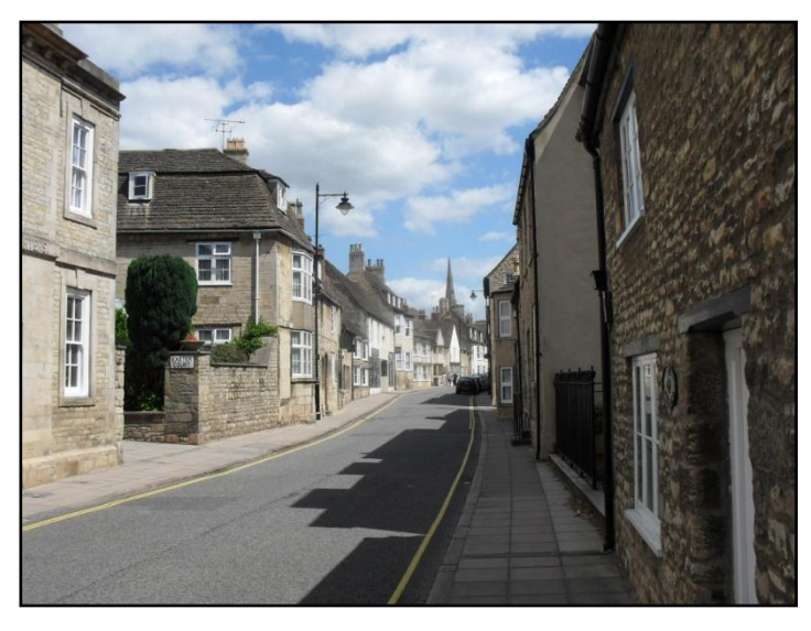
Fig. 17. Eastern view along St Peters Street.

Exeter Court, on the north side of St Peter's Street, is an early 19<sup>th</sup> century courtyard development. It was built to the rear of No. 24 and comprised of two rows of cottages across a narrow yard. The east range was modernised in the 1980s and is Grade II listed; the western range was demolished in the post war period.