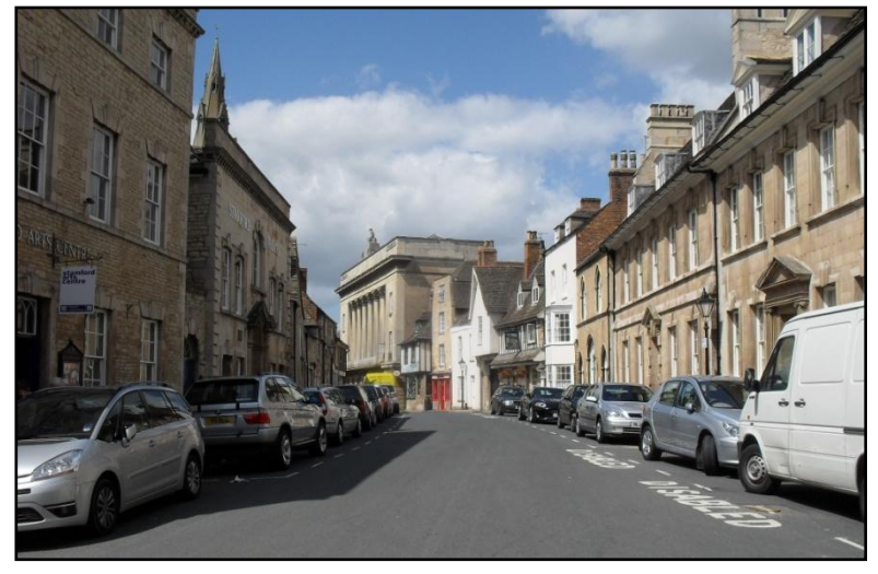
Fig. 12. Western view along St Mary's Street with the Stamford Hotel on the right.

There are several attractive examples of traditional 19<sup>th</sup> century shop fronts, including Nos. 11-12 (currently occupied by Sinclairs), 13, 14 and 31.