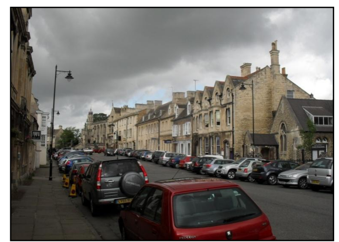
Fig. 10. View westwards along Broad Street towards Browne's Hospital.

garden of North Wall House are visible in the western views along the street and soften the appearance of the urban environment.