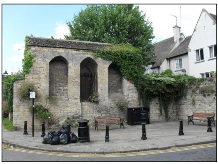
Fig.2. Remains of the Great Hall, Bath Row.

the 12<sup>th</sup>-13<sup>th</sup> centuries due to its strategic location on major lines of communication. The Great North Road from London to York passed through the town along High Street St Martin's and Scotgate whilst the navigable River Welland allowed access to the North Sea ports for trade to the Continent. Grain and wool from the rural hinterland was