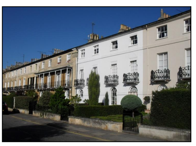
Fig. 30. Rutland Terrace.