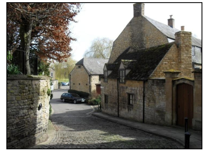
Fig. 19.Southern view along Kings Mill Lane to St Peter's Vale.

north-south from St Peter's Street to St