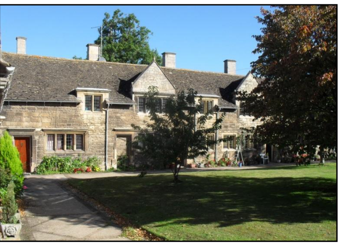
Fig. 28. Lord Burghley's Hospital.

The river, town meadows and main settlement on the north bank can be alimpsed between the buildings on the north side. The spires of St Mary's, St John's and All Saints'