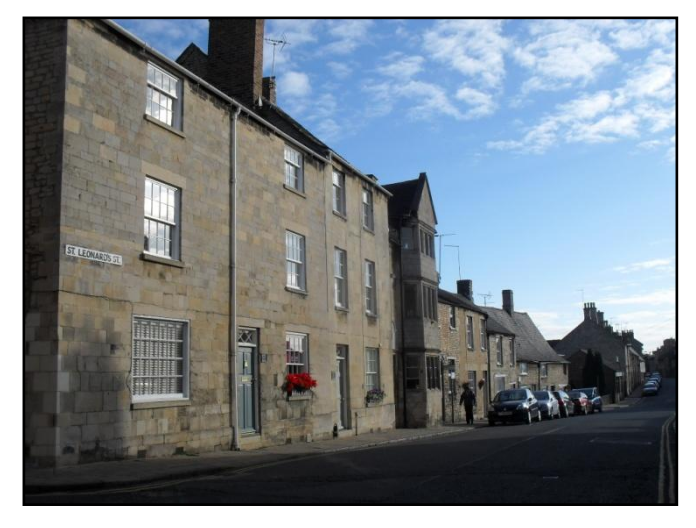
Fig. 24. Eastern view along St Leonard's Street.