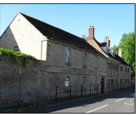
Fig. 29. Former brewery buildings on Water Street.

The south side comprises of small scale buildings, some of which are