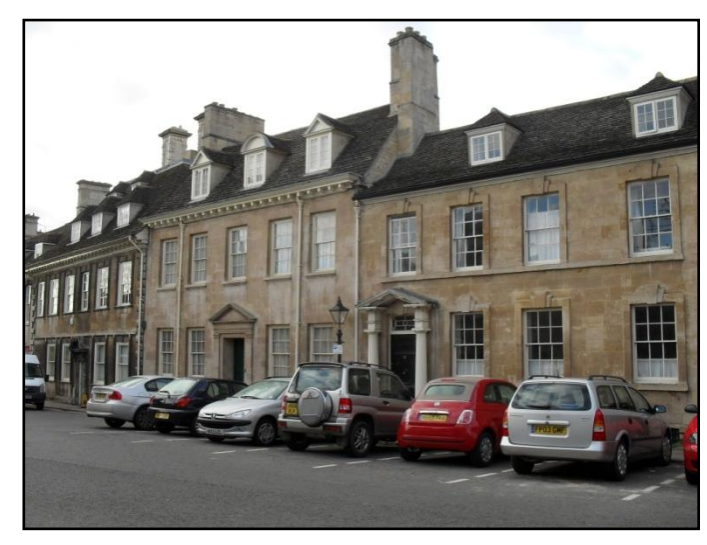
Fig.22. South side of St George's Square.