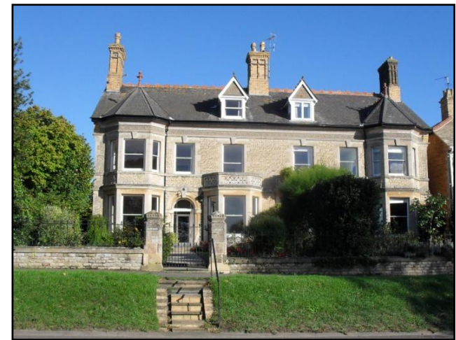
Fig. 31. Example of late Victorian houses on Tinwell Road.

Lodges at Burghley Park, the parish of St Martin's and the neighbouring village of Wothorpe which stands on the rise of the valley slope.