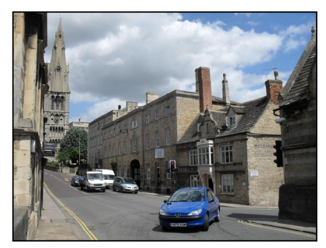
Fig. 13. East side of St Mary's Hill.

panoramic views southwards across to St Martin's with St Martin's Church prominent within the views. The return view northwards along the street is dominated by St Mary's Church. There are attractive views eastwards and