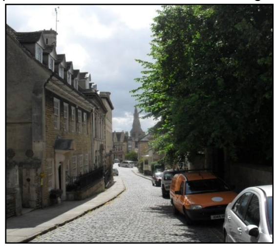
Fig. 9 Southern view along Barn Hill to St Mary's Church.

There are few examples of unified terraces or building groups and these exist only on a small scale. This was due to the pattern of land ownership; the Earls of Exeter were the major landowners and most new work was undertaken on building leases, therefore houses were rebuilt as individual tenements rather than as part of a large scheme. The earliest example of a conscious street design dates from 1700; Nos. 15-17 High Street was built as a terrace of three buildings and No. 14 deliberately matches them in style. In the 18<sup>th</sup> century pairs of houses were constructed to give the impression of a large house,