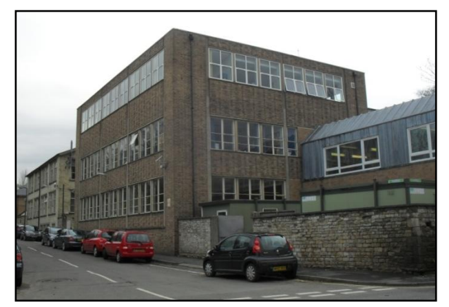
Fig. 27. Stamford School buildings on Park Lane.