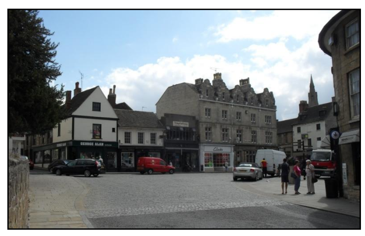
Fig. 14. East side of Red Lion Square.

The recent public realm improvements around the square and All Saints' Place have enhanced the setting of the buildings and made the square an attractive focal point.