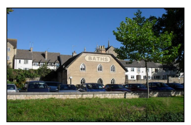
Fig. 20. The Bath House

exception of the Bath House. The rear elevations of Warrenne Keep are partially obscured by a high stone boundary wall. The Bath House dates from